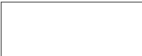
Specimen Signature of the Candidate